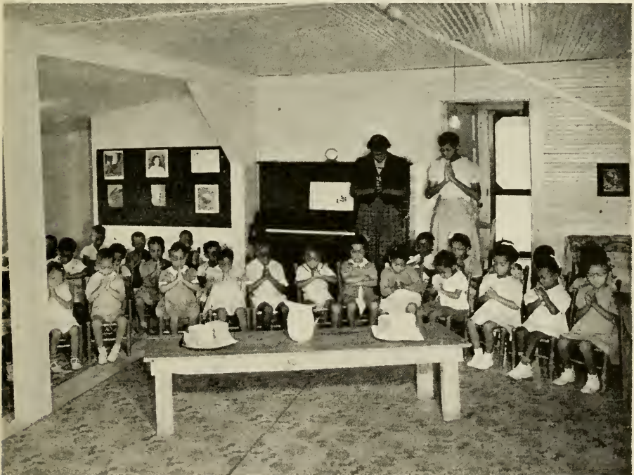
Bethlehem Center children, Spartanburg, South Carolina, ask a blessing at lunchtime